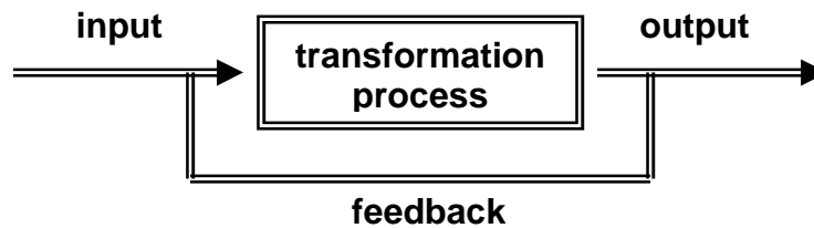
Figure 1 Economic System

A complex economic system is made by the following components (figure 2): decision system ; operating system ; information system .